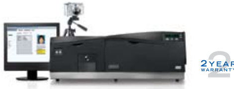
DTC550 printer/encoder shown with optional lamination module.