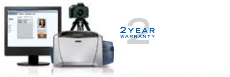
DTC400 printer/encoder shown with Fargo Asure ID software.